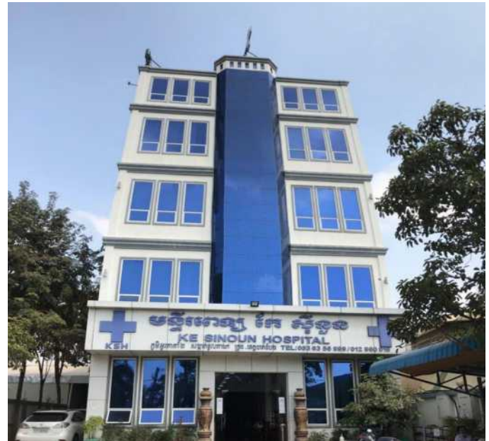
Ke Sinoun Hospital in Battambang province

Japanese Eye Clinic is located on the 8th floor of Building #82A, Street 154, Sangkat Phsar Thmey III, Phnom Penh.