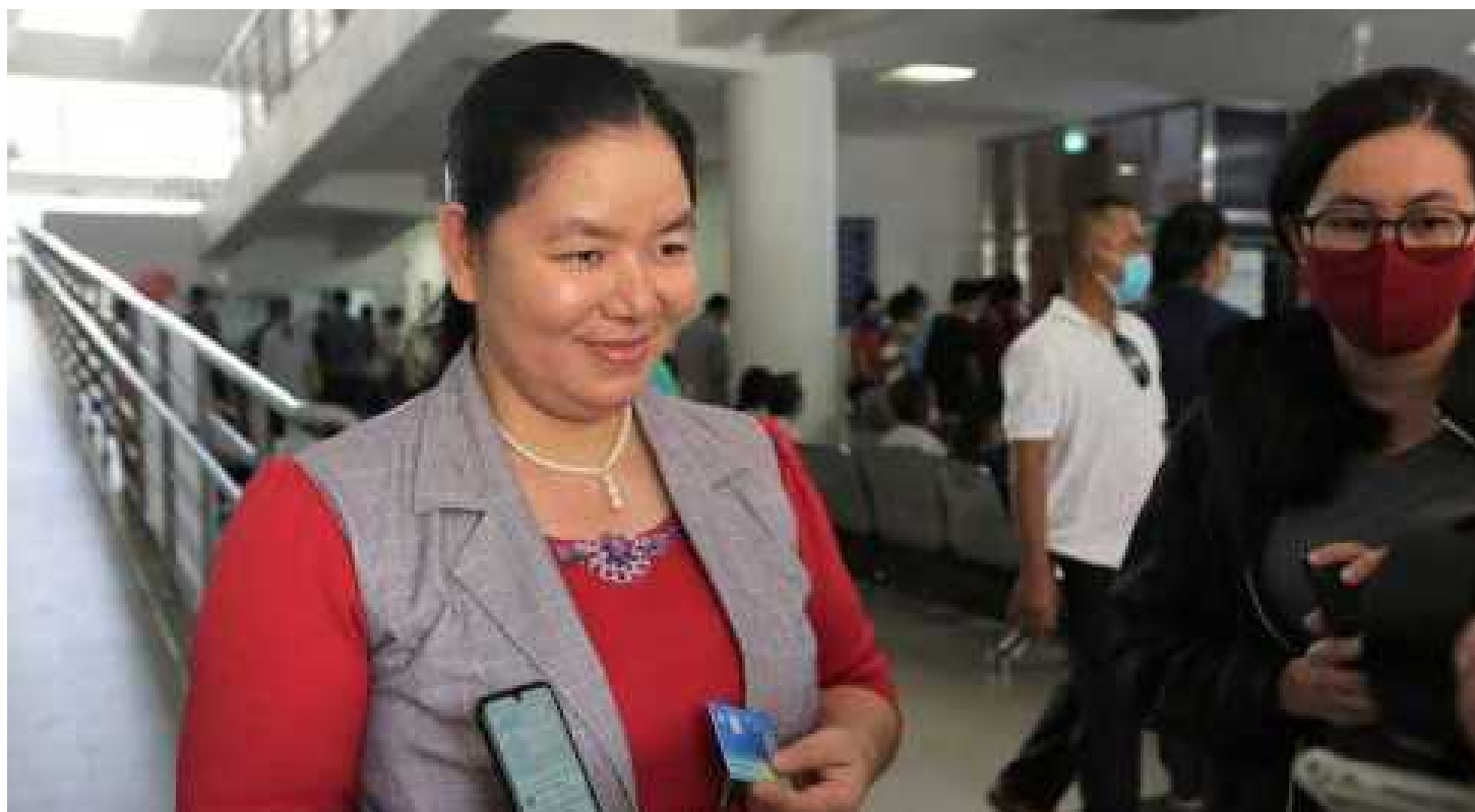
The Women Enterprise Recovery Fund, sponsored by the UN Economic and Social Commission for Asia and the Pacific (UNESCAP) and the UN Capital Development Fund (UNCDF)