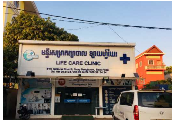
Life Care Clinic in Siem Reap province