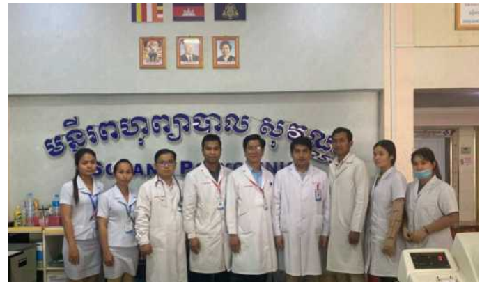
Sovann Polyclinic in Battambang province