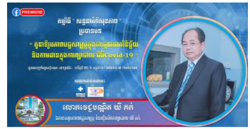
Dr. Yi Kuok

Imagery play a vital role in the COVID-19 treatment process. Some asymptomatic patients reside or travel around the highly infected areas, thus, it is of importance for them to go through lung screening to raise precautions in preventing severe illness.